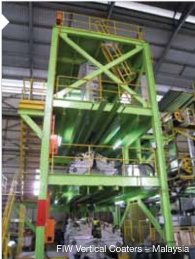
FIW Vertical Coaters – Malaysia

All Bronx Colour Coating lines can be configured for Satellite operation. Satellite reduces the line equipment required by removal of the cleaning and pretreatment sections. The pretreatment function is carried out at the exit end of a galvanising line, prior to the coil entering the Satellite Colour Coating Line.