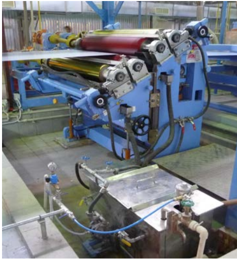
b) Horizontal pull through, driven rolls