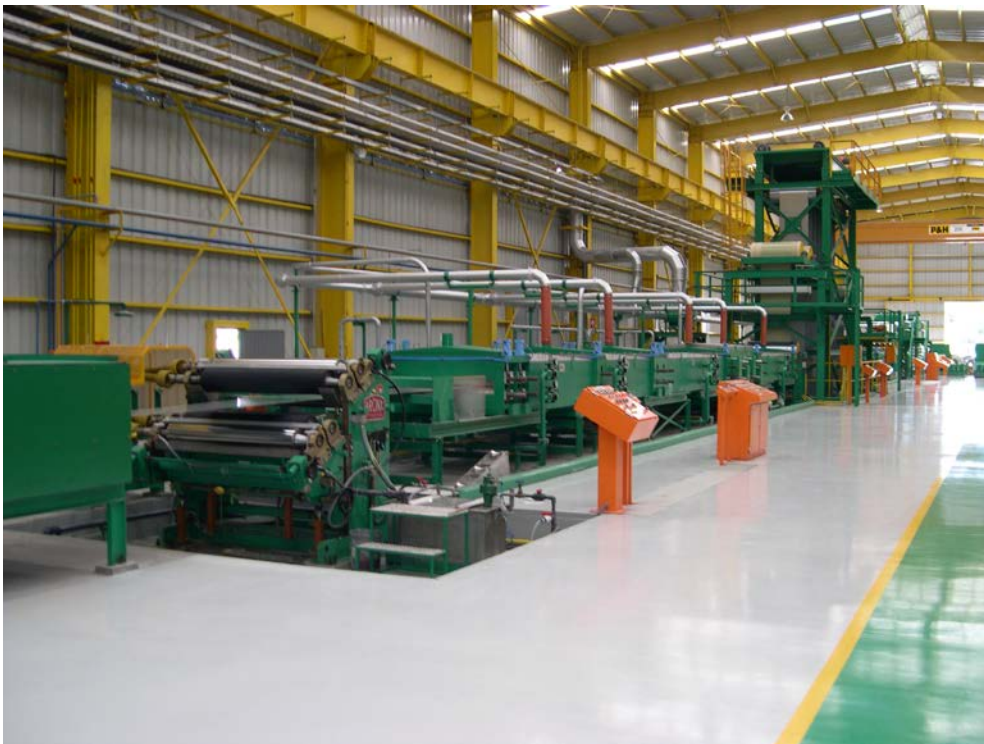
Typical cleaning and pre-treatment section of a coil paint line

There are a number of pre-treatment chemical and paint alternatives available. It is very often said that the success of a coil coater is due to how closely he marries his operation with pre-treatment and paint suppliers. There should be constant communication at all levels to be sure that the most economical and suitable quality is being achieved. Those that do not practice this can soon fall behind the market.