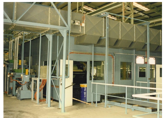
Figure 9.0: Typical Paint Coater Room

The general rule of thumb is to ventilate the coater room at 60