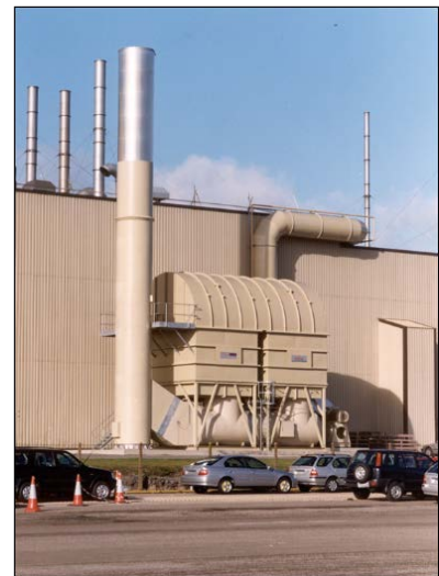
Figure 4.0: Two Canister Regenerative Oxidiser

Taking into account the thermal efficiency and the short payback period of the regenerative thermal oxidiser the regenerative thermal oxidiser based system is often the system of choice.