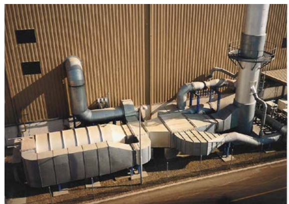
Figure 2.0: Recuperative Thermal Oxidation System with Primary and Secondary Heat Recovery

The higher pre-heat temperatures, although requiring more capital expenditure, do reduce fuel consumption and overall plant running cost.