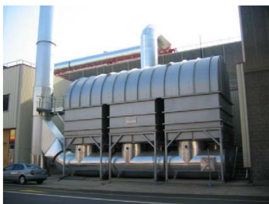
Figure 3.0: Three Canister Regenerative Oxidiser

After pre-heating the oven exhaust gasses in the primary heat exchanger the exhaust enters the oxidiser VOC destruction (or dwell) chamber via the burner chamber where it is heated to 760°C and held for the required dwell time.