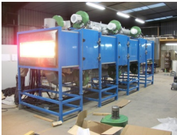
Figure 7.0: Electric Infrared Paint Curing Oven

The development of Infrared ovens using short wave frequencies or frequencies below the infrared frequency range (often referred to as near infrared) have been successfully applied to the curing of paint coatings on coil painting lines.