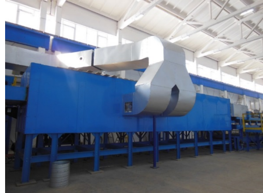
Figure 6.0: Gas Fired Convection Paint Curing Oven for 40 m/min Coating Line

It is also worth mentioning that if necessary convection paint curing ovens can be installed in the vertical plane however this is not common due to the additional cost of the supporting structure and increasing the building roof height.