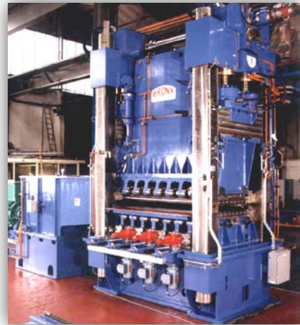
Heavy Duty Precision Levelling Machine