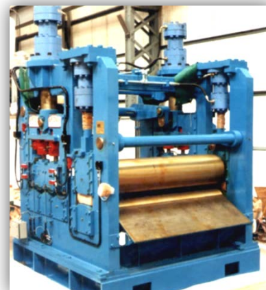
Heavy Duty Flattener

Manufactured to the same high standard as the work rolls and fitted with combined radial and thrust anti-friction end bearing assemblies.