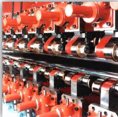
Work Roll Assembly

Bronx levellers can be supplied in a variety of configurations, including 11, 17, 21 or 23 work rolls suitable for hot and cold rolled steel, coated, stainless steel and aluminium. All the work rolls are fully supported by heavy duty back up bearing assemblies with adjustments where applicable using motorised wedge units.