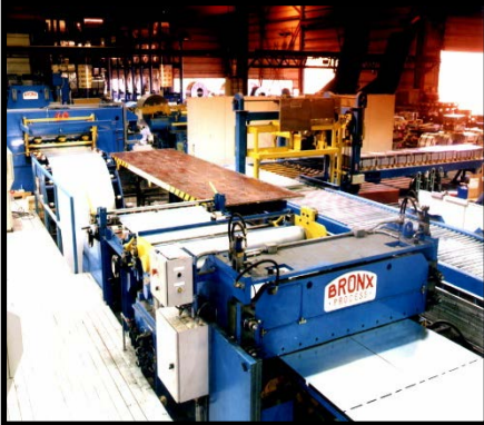
Kombi type Blanking Line