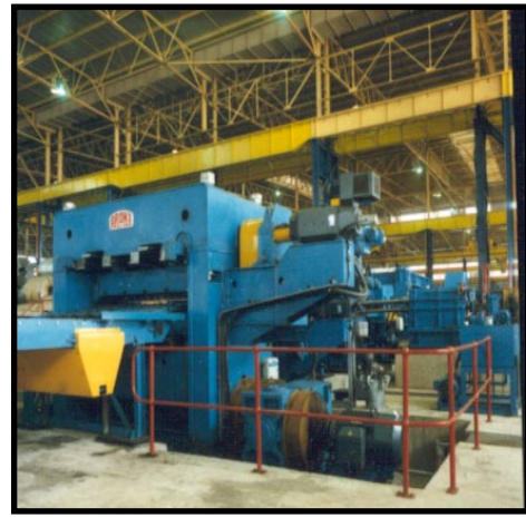
Flying Shear Line

The flexibility of this equipment also allows it to be used as a conventional cut to length line with or without edge trimming.