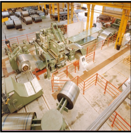
Kombi Lines (Multi Blanking Cut to Length)