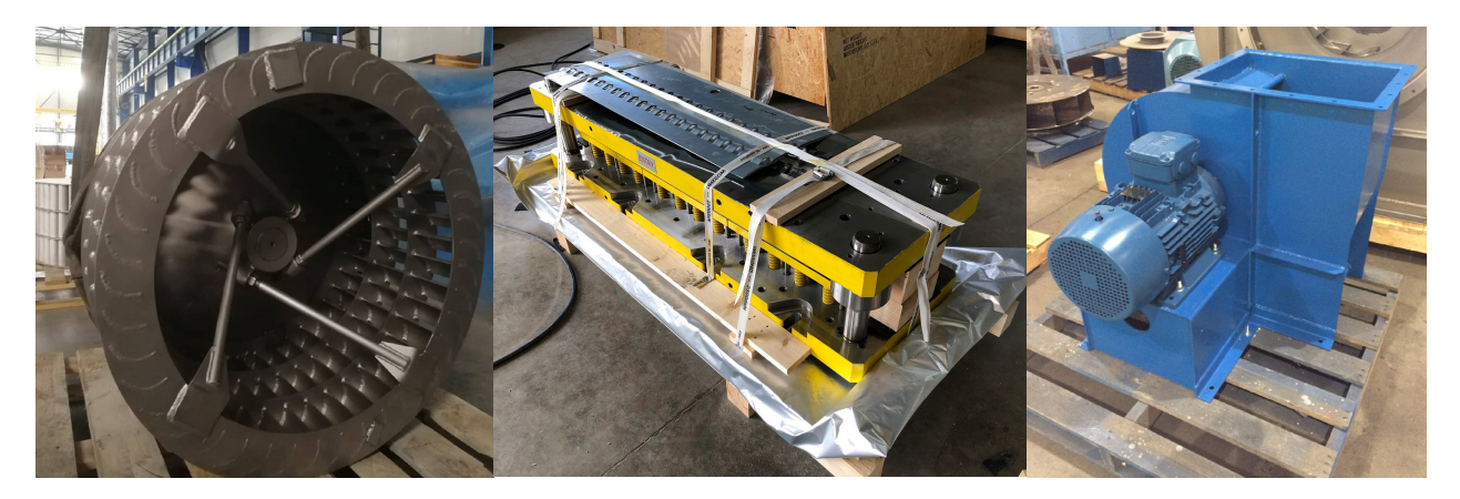
We have the know-how and experience to keep your equipment running efficiently.

Sub-assemblies incl. electrical, hydraulic, pneumatic components