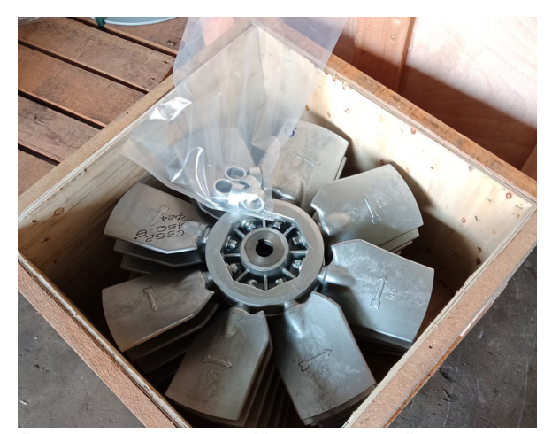
Bronx can supply specific parts as well as custom solutions depending on your business needs.

We pride ourselves on our ability to deliver optimal results and to help propel your business forward.