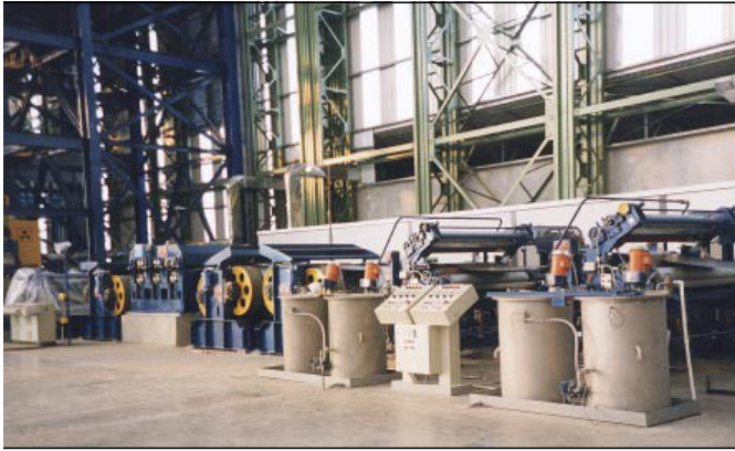
Tension Leveller with In-Line Installed in a continuous Galvanizing Line