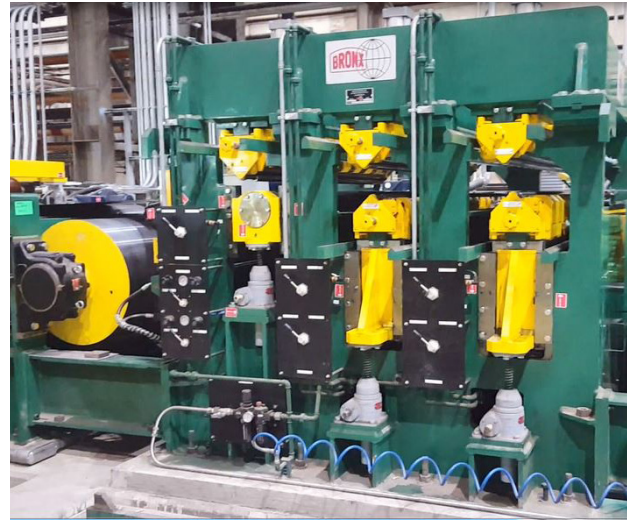
Bronx Tension Leveller Section

However, it does not totally remove the residual stresses within the material which can be an issue if the material is to be slit along its length or formed in later processes.