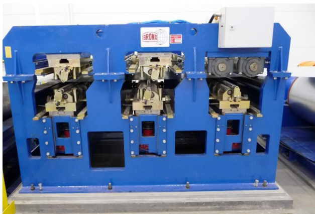
Four High Cassette

The flatness quality obtained and the overall reliability of the machines has been excellent. Our machines are durable and reliable, and very simple to operate.