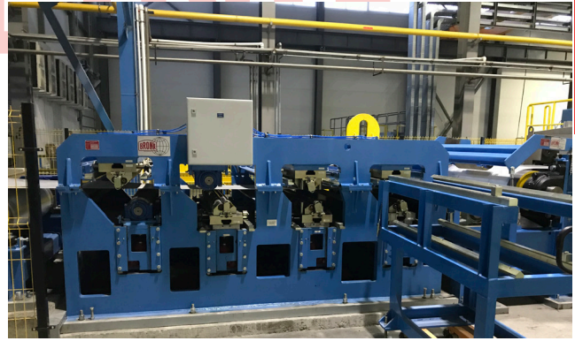
Bronx Tension Leveller Installation

A tension leveller effectively combines the design know how used for both roller levellers, and stretch levelling.