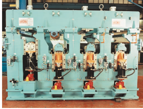
Leveller with 2 Work Modules and 2 De-Curving Modules

Having designed and built many successful tension level lines using various types of elongation control, after extensive evaluation Bronx has settled on supplying the all-electric bridle drive system.