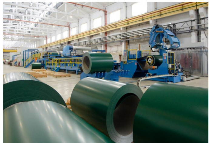
Bronx Warehouse Line, Slovakia

Despite their more compact size, the quality of the structure, equipment and production is equal to that of the conventional lines Bronx offers.