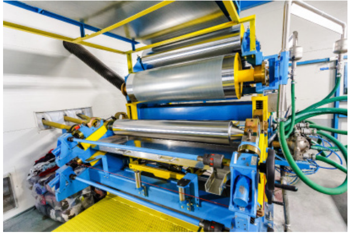
Quick Change "U" Wrap Coater